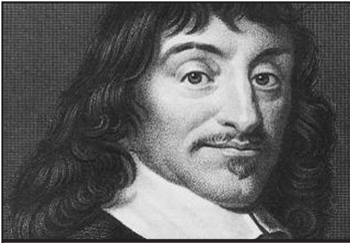
Renee Descartes, the father of rationalism

significance is that Descartes arrived at his conclusion through a nascent scientific method and without reference to biblical or other “beliefs.”